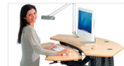
• Dual Surface Design w/ Tilting Keyboard Surface