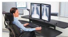
• Dual Surface Design