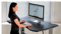
• Single Surface Design

Choose a dual surface table for more control over the individual surface height-adjustment. (some models have a tilting keyboard surface option)